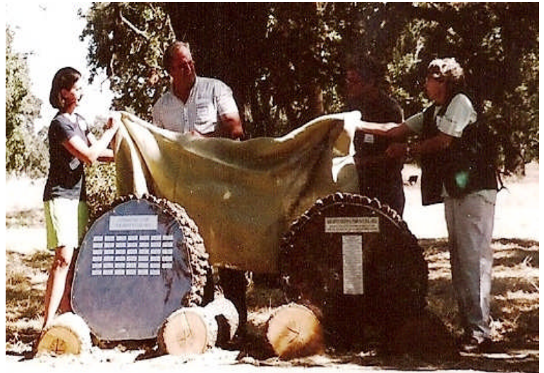
Photos from the Contributors Oak Rounds Unveiling