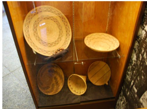
Several of the baskets that are on loan from the State Indian Museum.

can be so tight that the basket will hold water. Redbud and some other plants or dyed sedge