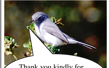
Thank you kindly for your tax-deductible contributions!