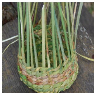
A twined tule basket under construction.

We should have a great time and we hope to see all of you there.